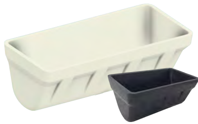
4B AA NYLATHANE™