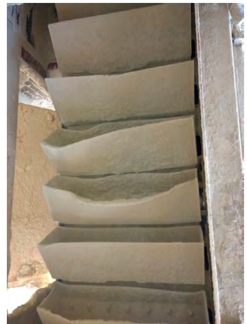
Metal buckets distorted and broken