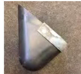
Nylathane™ bucket with bolt-on AR steel wear lip (side view)

In another industrial application, moving glass cullet, the replacement of heavy steel buckets with the lighter Nylathane™ buckets provided a nearly 80% reduction in startup current. Saving both energy and electrical component costs. The installation was also quicker and safer with the lighter Nylathane™ buckets taking just one day to install compared to the usual three days with the steel.