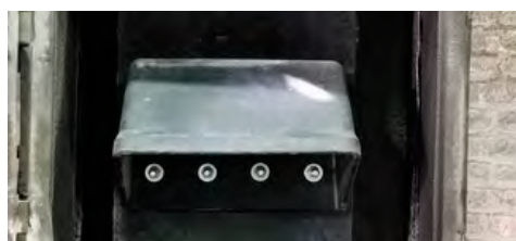
Nylathane™ buckets installed in glass cullet elevator