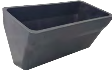
4B AC NYLATHANE™