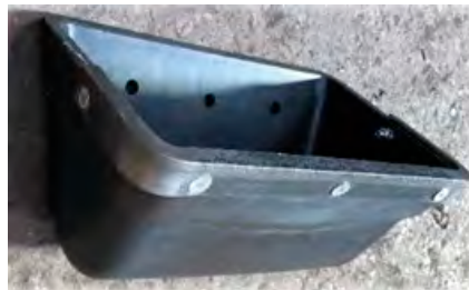
Nylathane™ bucket with bolt-on AR steel wear lip (front view)